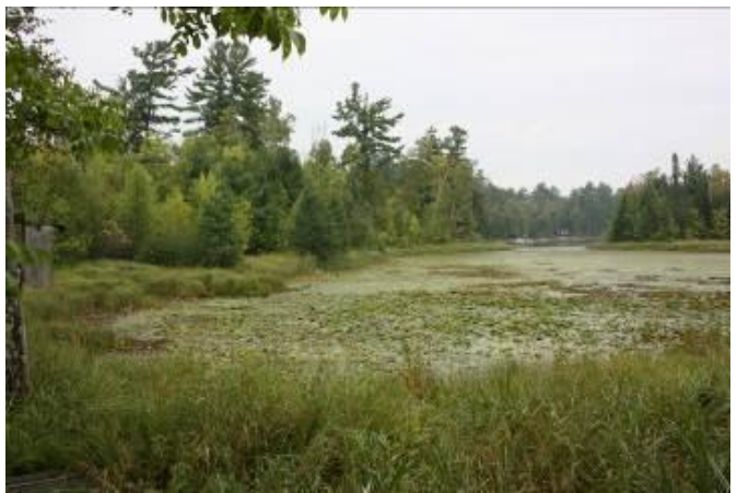
view of shoreline from adjacent parcel to south