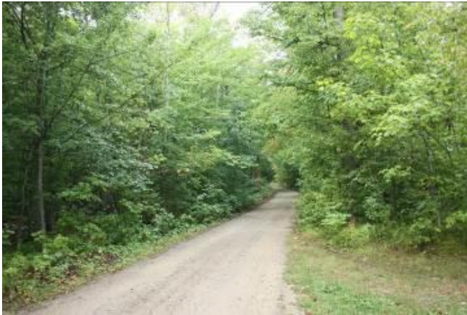
View north along access road from south property corner