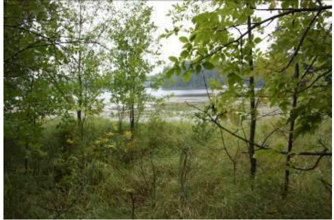
View of shoreline from interior