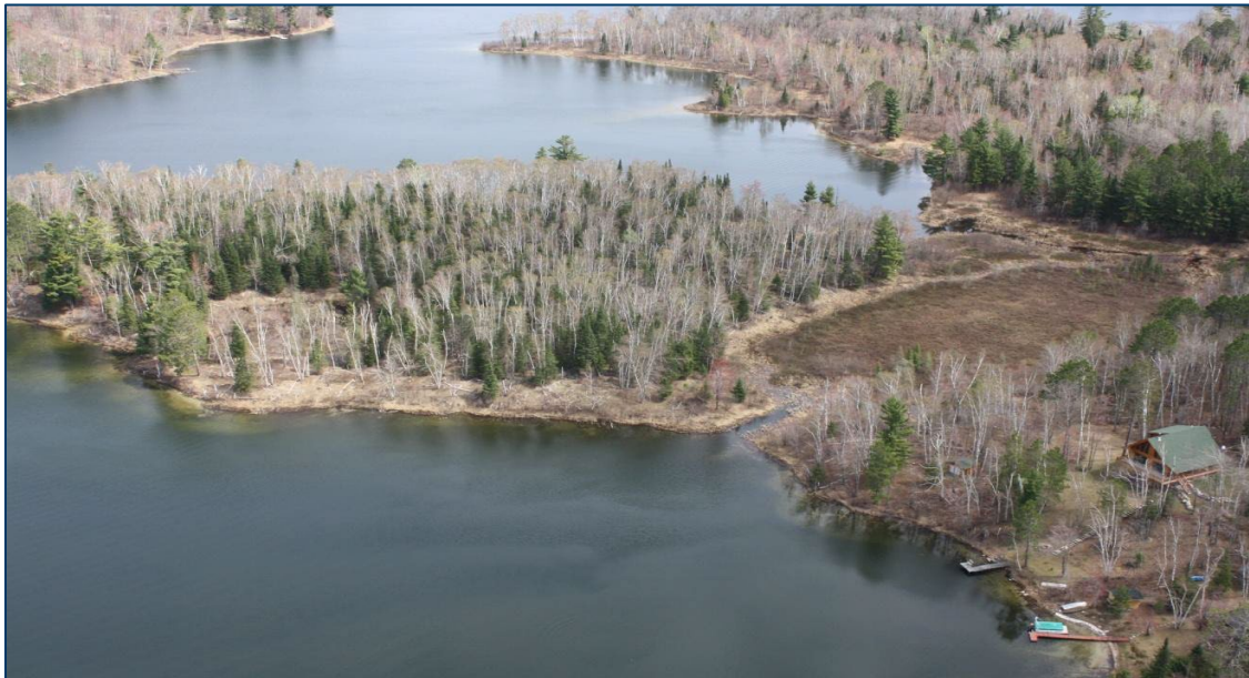
Aerial view of the property from the south (please note: this is an older picture).