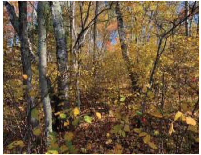
Interior site view of south lakeshore, looking easterly.