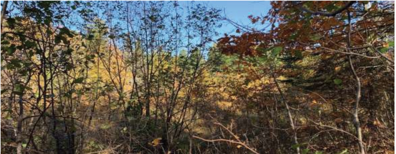
Interior view of the wetland acres, situated between the road ROW and upland acres to the north.