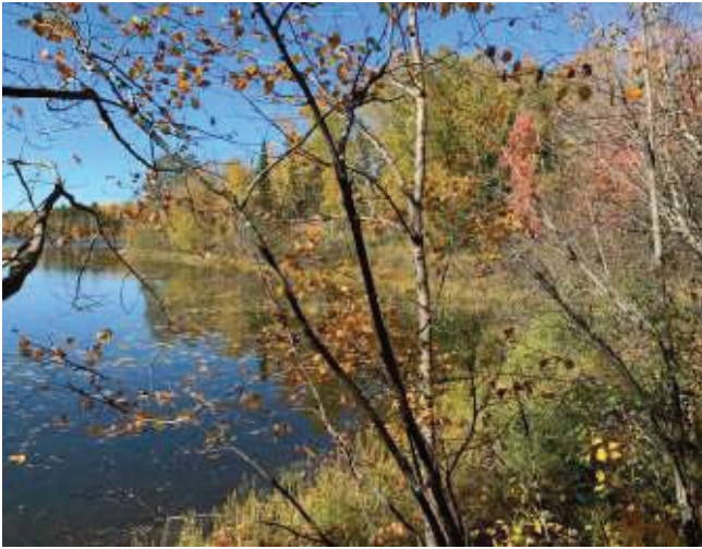
Shoreline View, looking northerly (low and wet).