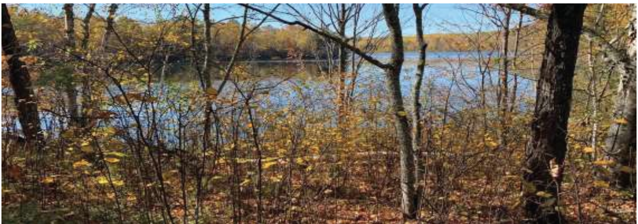
Lakeshore view from the southerly property line. The southern lakeshore acres are low.