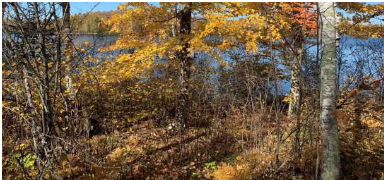
View at the northern lakeshore access.