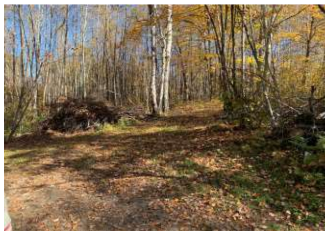
North end of road, looking easterly.