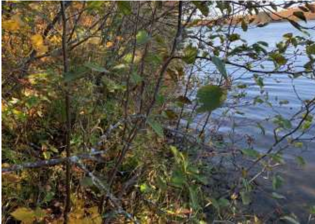
Northern shoreline, firm and mostly level.