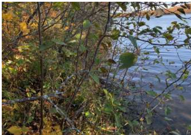
Northern shoreline, firm and mostly level.