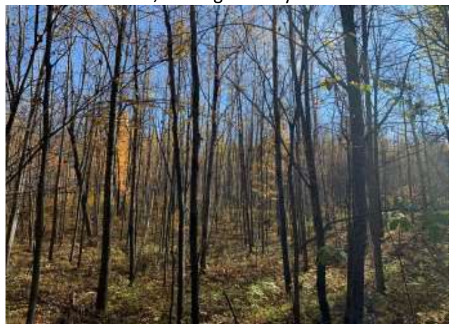
Southern upland acres, looking west of road.