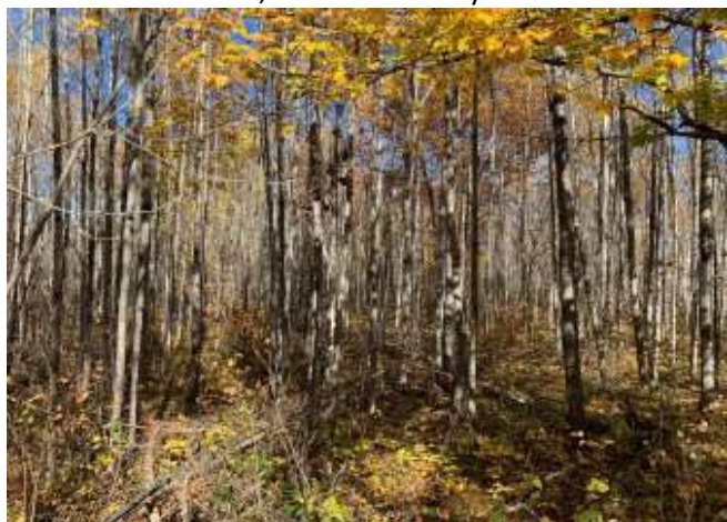
Interior wooded acres (aspen regen) looking N of road.