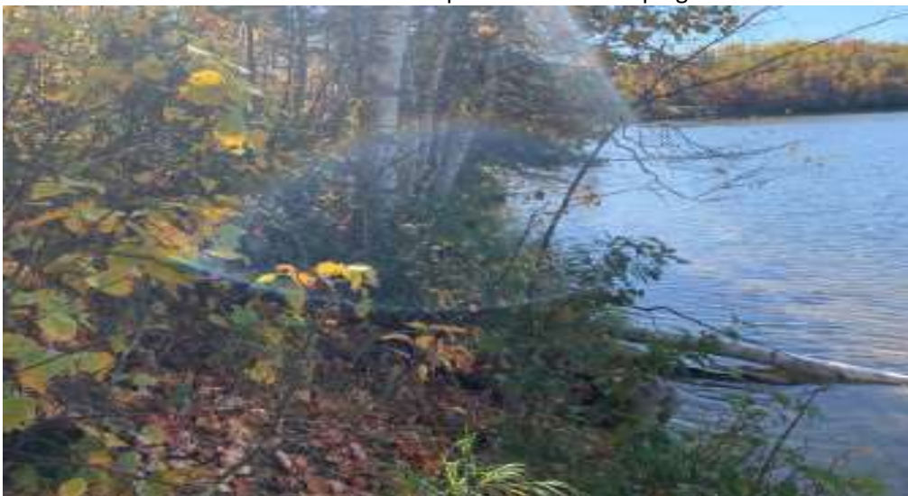
Shoreline frontage, looking southerly.