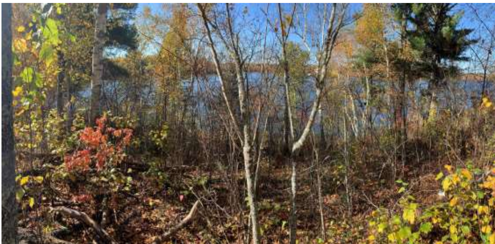
Lakeshore view. Lakeshore acres are steep but becomes sloping at the shoreline.