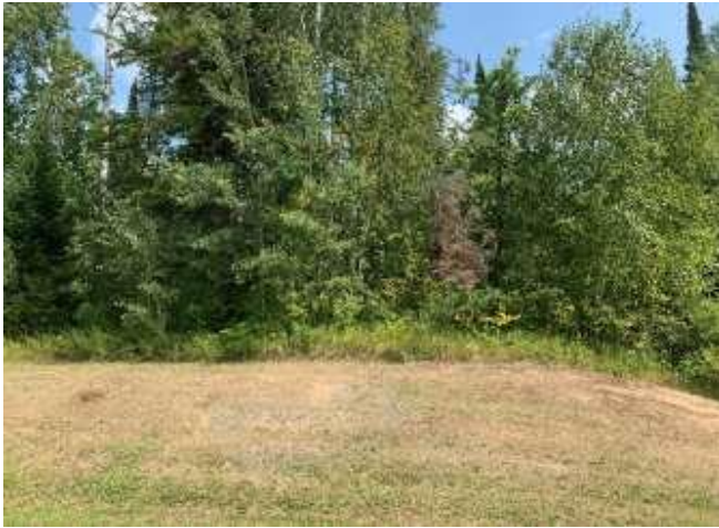
Road view, looking easterly