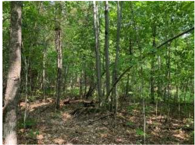
Wooded interior of the parcel.