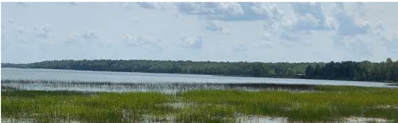
Lake frontage view of Splithand Lake looking easterly from the shoreline.