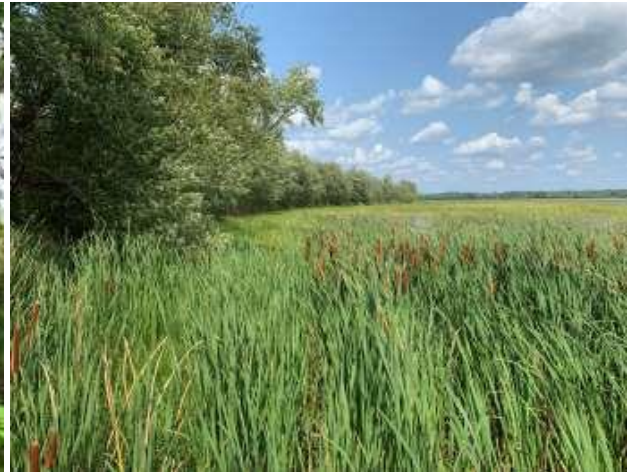
Shoreline, looking northly