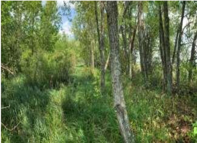
Waterfront acres, looking northerly