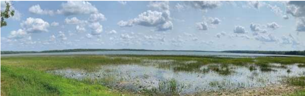
Frontage of the North parcel of Splithand looking easterly from the shoreline.