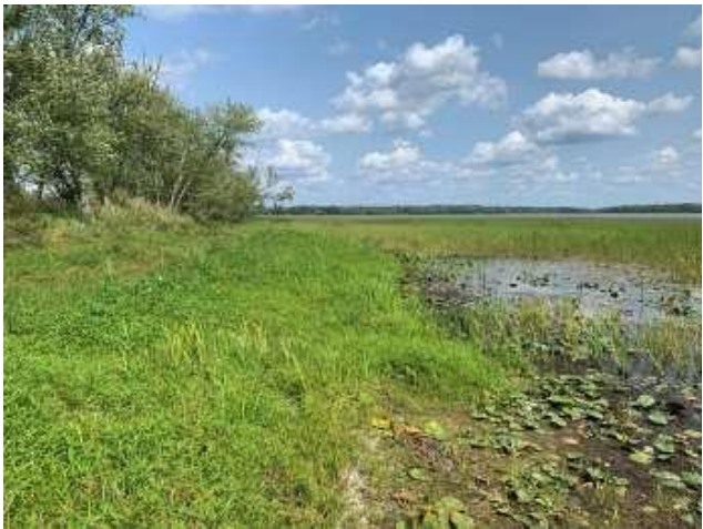
View of shoreline, firm and shallow