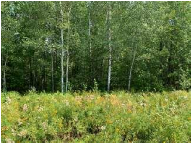
Roadside view of property