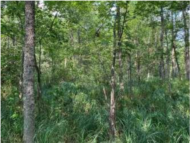
Waterfront acres, low and soft