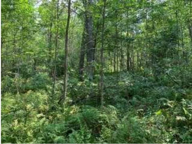
Interior view of property