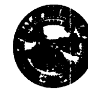
Contour Map Contour Interval: 5'

STATE OF MINNESOTA Department of Administration Minnesota's Bookstore Part of the Department of Administration Print Communications Division To order reproduced copies of Contour Lake Maps call: 612/297-3000 or our Nationwide toll-free number 1-800-657-3787