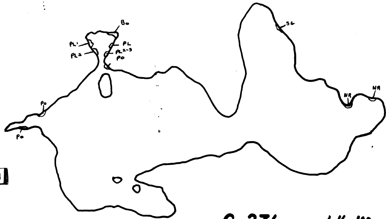
Aquatic Vegetation Map