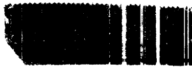
Aquatic Vegetation Map