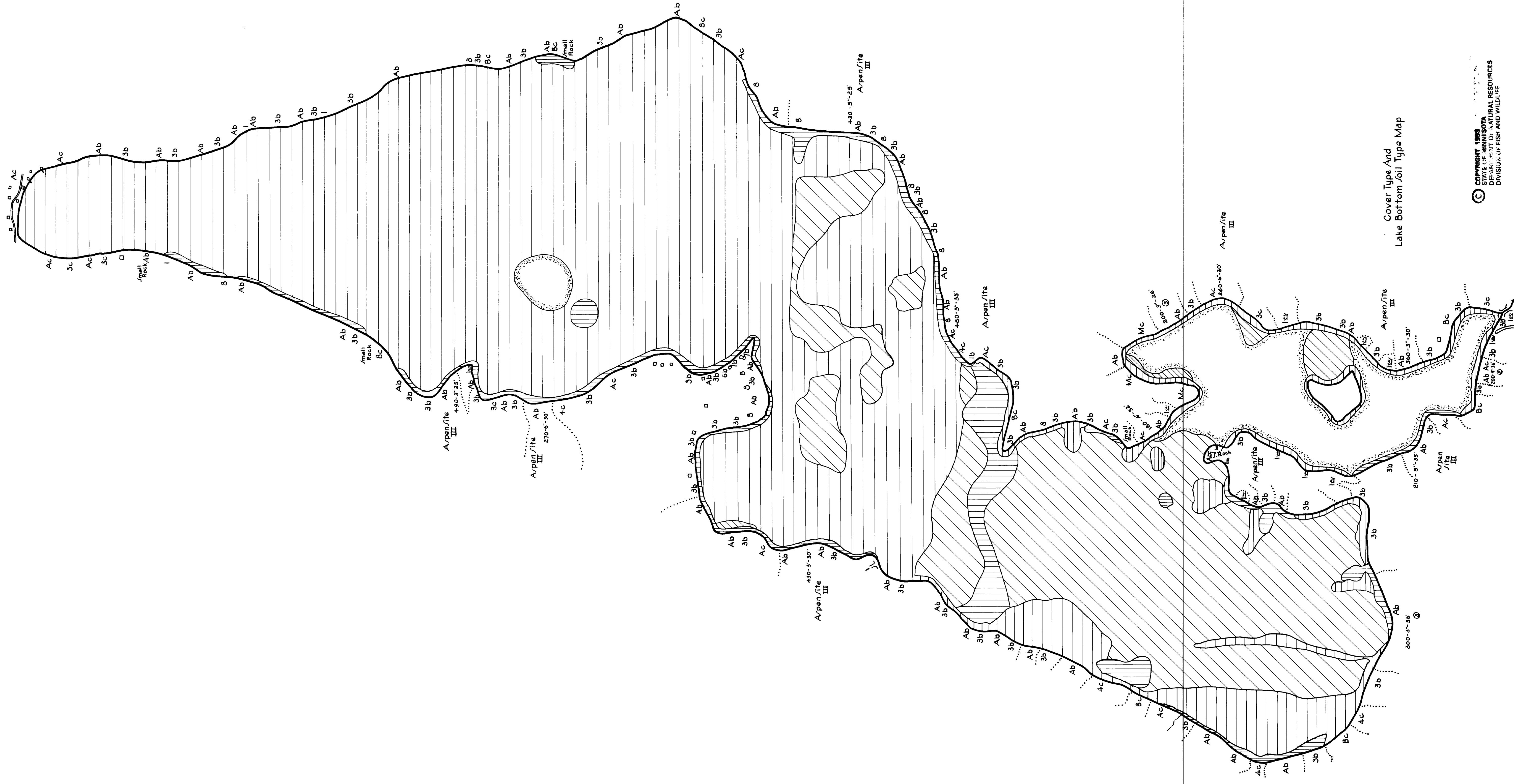
Cover Type And Lake Bottom Soil Type Map

Area 1659 Acres/ Length of Shore Line 13.12 Miles