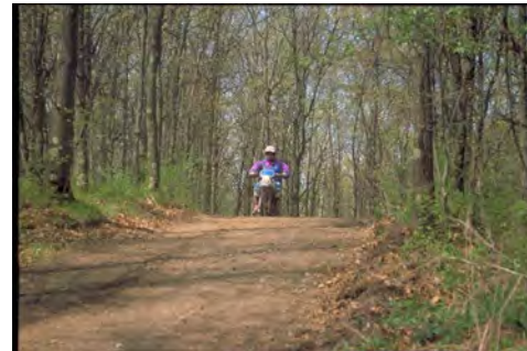
Off-highway motorcycle "OHM"