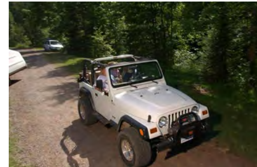
Off-road vehicle "ORV"