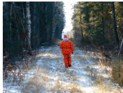
Hunter walking trail