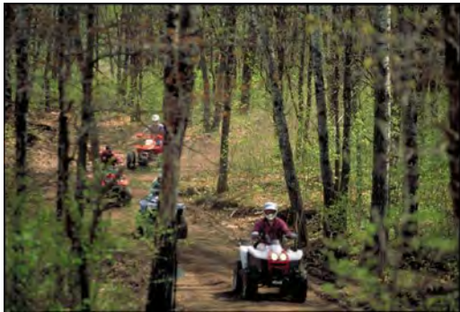
All-terrain vehicles "ATV"