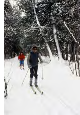
Cross country skier