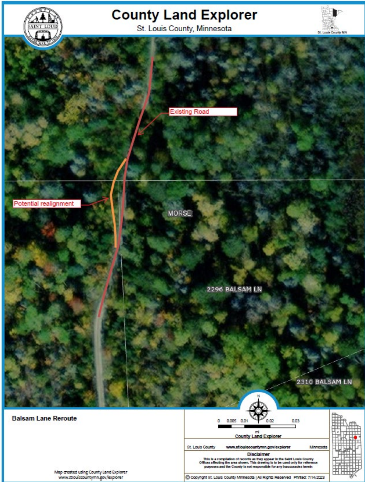
Figure 2. The image shows the locations of Balsam Lane, parcel lines, and the potential realignment location.