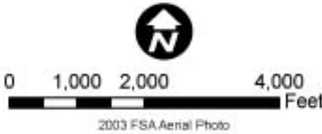
Figure 18-1 Seep Locations Tailings Basin