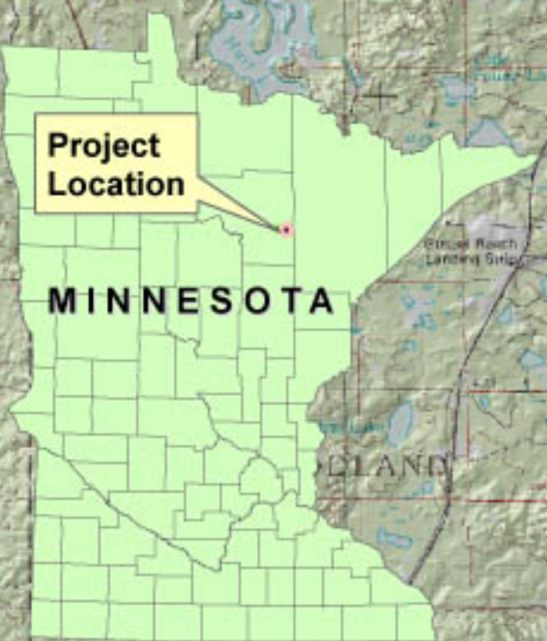
Figure 5-2 PROJECT LOCATION USGS 1:100,000 Scale Map Minnesota Steel Industries Nashwauk, Minnesota