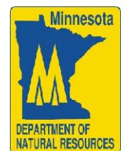
Figure 4.3.1 Threatened and Endangered Species U.S. Steel Keetac Keewatin, MN

Source: USGS, Barr, LMIC, MNDNR, National Hydro Dataset, MPCA, Itasca County, St. Louis County, City of Hibbing, City of Nashauk, U.S. Steel, and Mn/DOT. 2008 Aerial Photograph