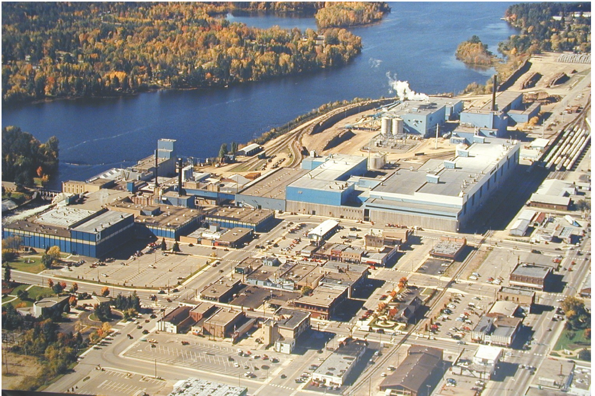
Figure 1.4 - Aerial Photo of the Existing Site Draft Environmental Impact Statement Minnesota Department of Natural Resources UPM/Blandin Paper Thunderhawk Project