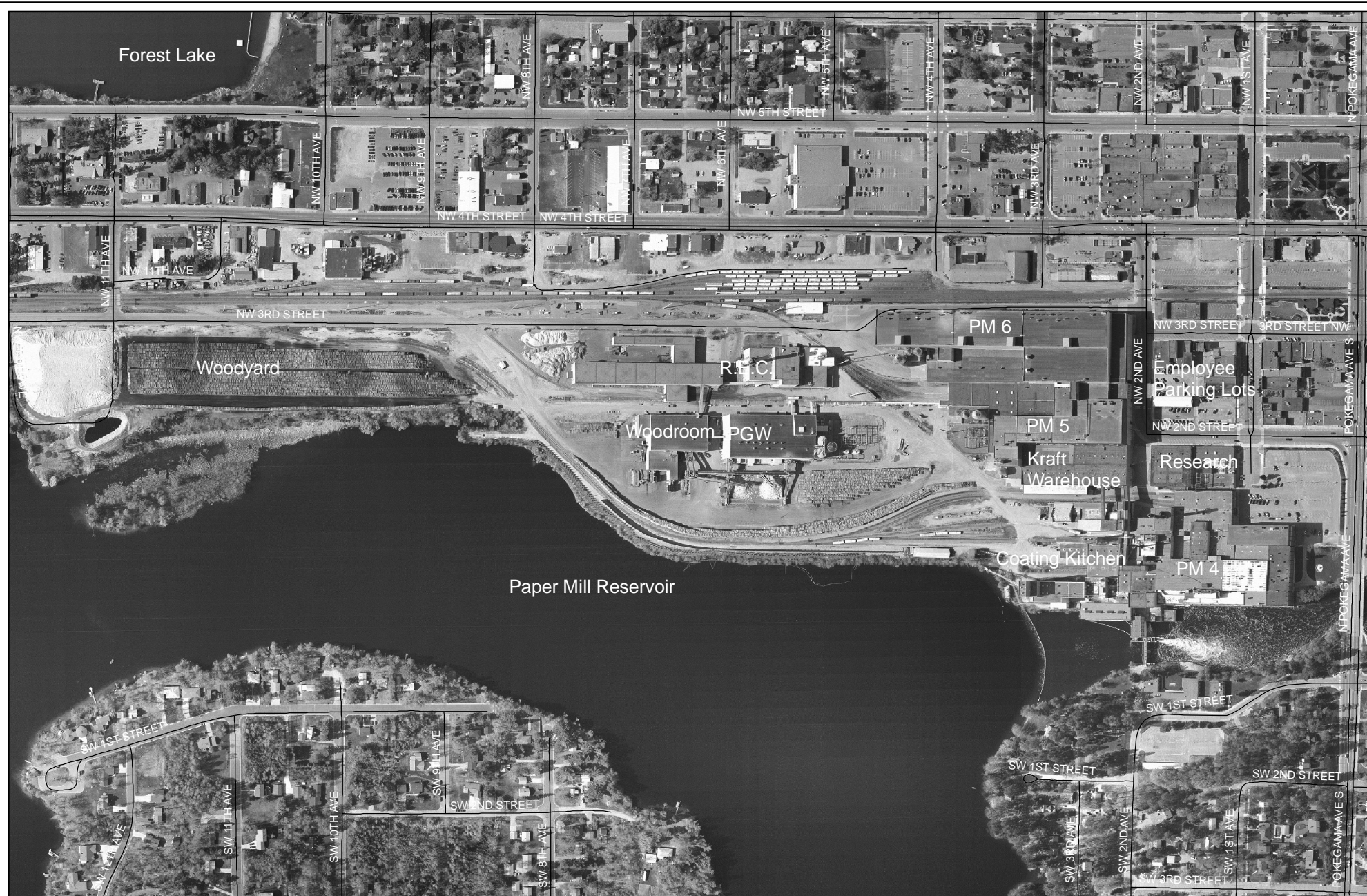
Figure 1.3 - Existing UPM/Blandin Paper Mill Layout Draft Environmental Impact Statement Minnesota Department of Natural Resources UPM/Blandin Paper Thunderhawk Project