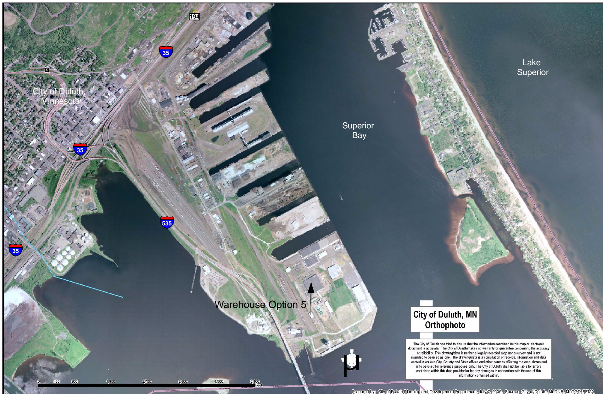
Figure 1.5 - Location of Warehouse Option 5 Draft Environmental Impact Statement Minnesota Department of Natural Resources UPM/Blandin Paper Thunderhawk Project