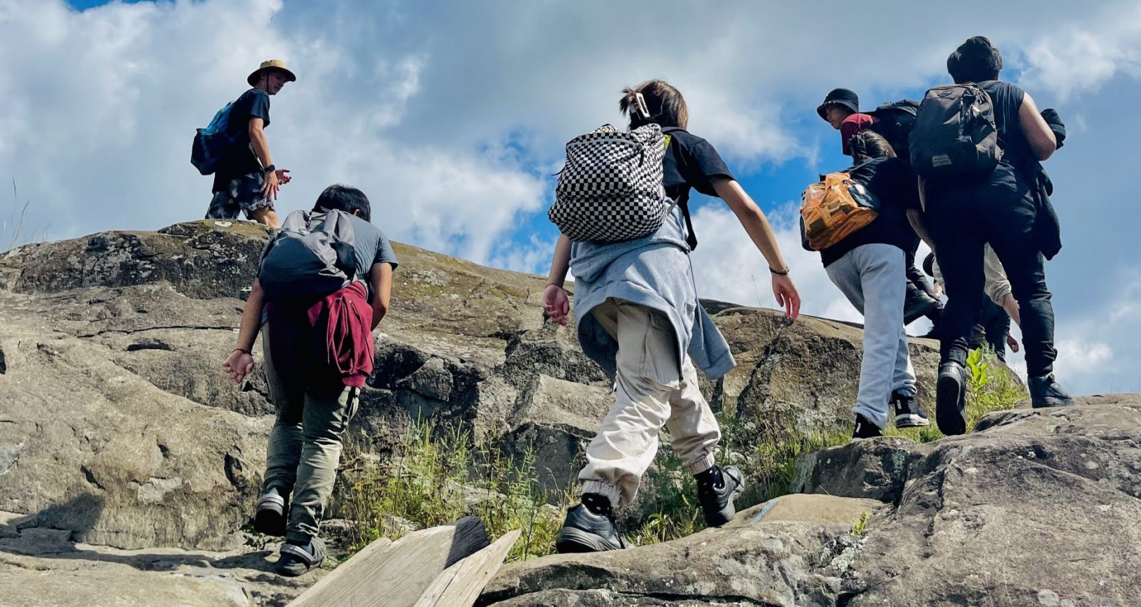
Photo courtesy of Thia Xiong – 2022 NCLI Grantee Urban Roots – Superior Hiking Trail, Duluth, MN