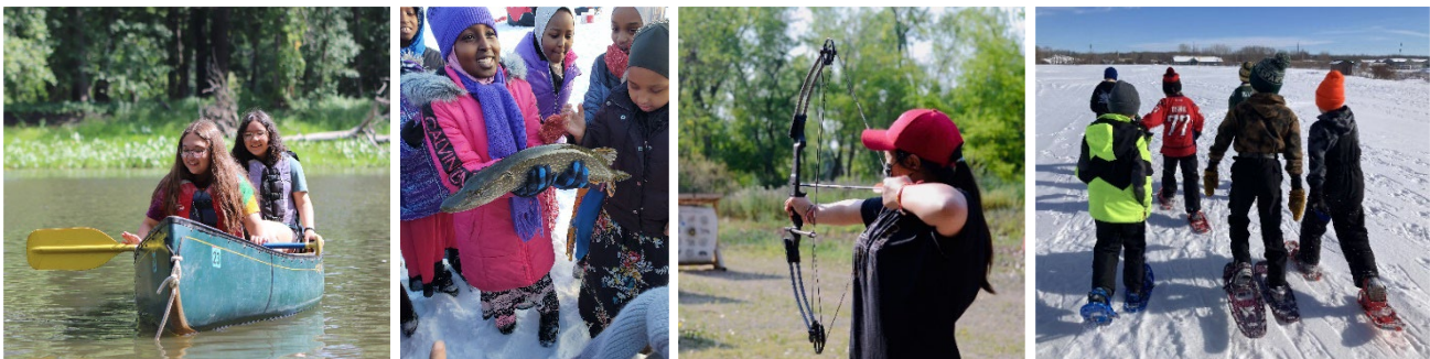
MN DNR extends its thanks to the Connecticut Department of Environmental Protection for the use of "No Child Left Inside."