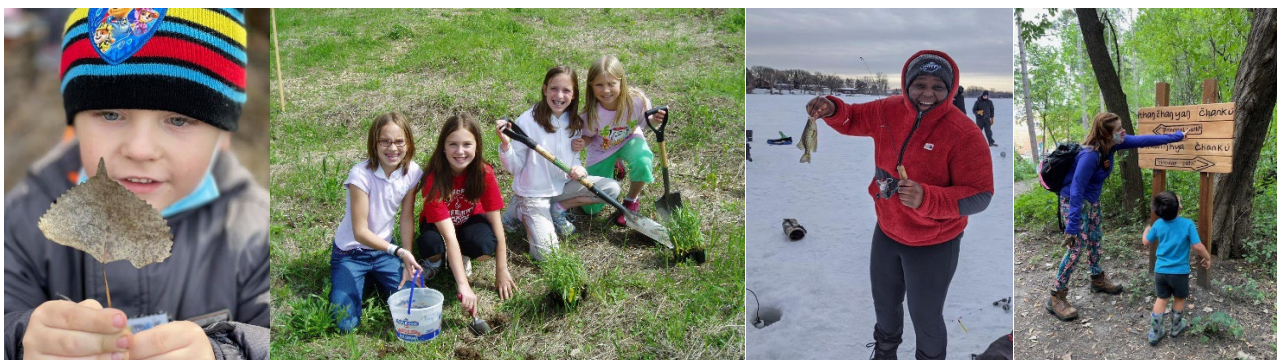
MN DNR extends its thanks to the Connecticut Department of Environmental Protection for the use of "No Child Left Inside."

If you have a question about these grants or any of the application materials, please email outreachgrants.dnr@state.mn.us with the subject line “Grant Questions” or call 888-MINNDNR (888-646-6367).