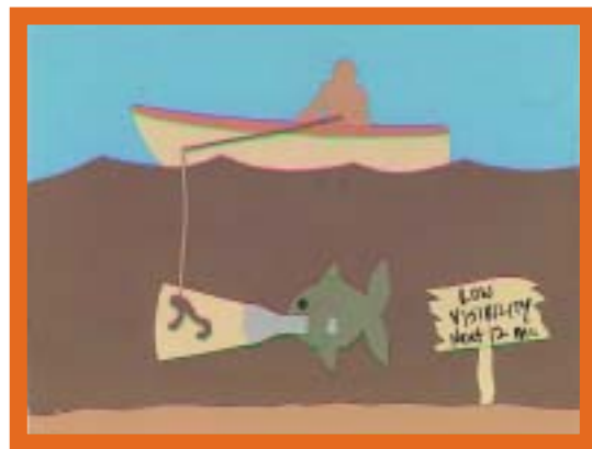
Sediment clouds the water, creating poor swimming, fishing and boating conditions.