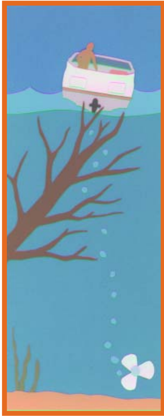
Hitting deadheads can damage lower units and propellers.