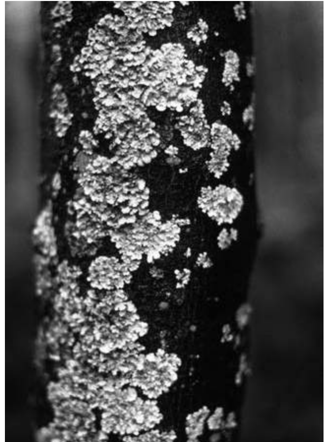
Trees help support many other living organisms, including these lichens. Far from harming the tree, lichens indicate pollution-free air.

For each tree and direction, record the number of circles that show lichens. This number represents the percentage of lichen coverage.