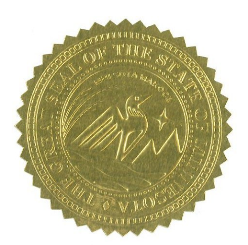
IN WITNESS WHEREOF, I have hereunto set my hand and caused the Great Seal of the State of Minnesota to be affixed at the State Capitol this 13<sup>th</sup> day of March.