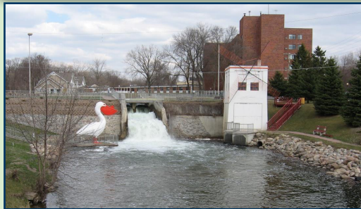
The deteriorating dam in Pelican Rapids, MN was modified into a Rock Arch Rapids winter 2022/2023. The ramp gradually steps down the water 5 feet over 12 arches.