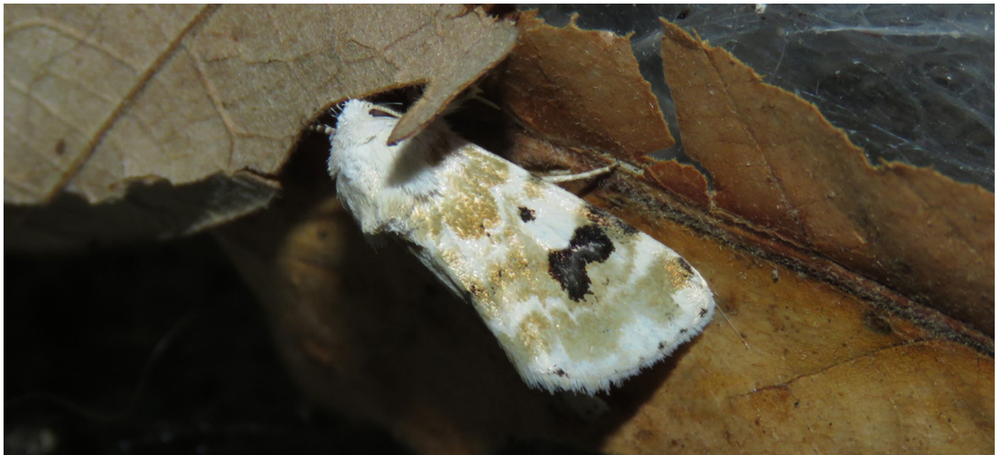
Schinia nundina (goldenrod flower moth) uses Aster lanceolatus (panicled aster) as a host plant.