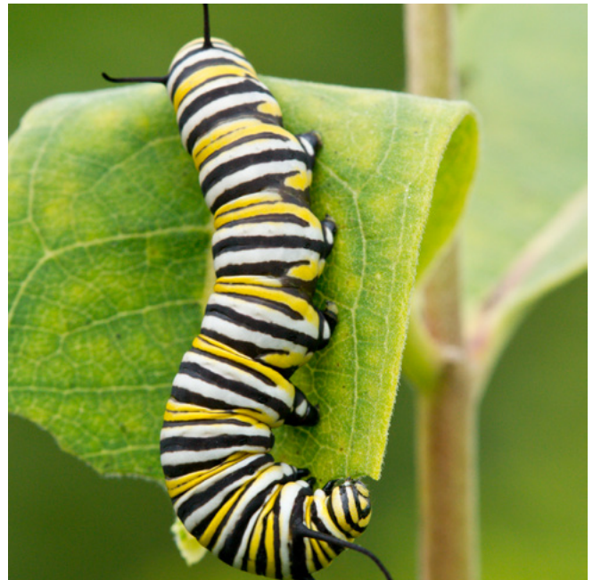
Danaus plexippus (monarch) uses Asclepias (milkweed) species as a host plant.