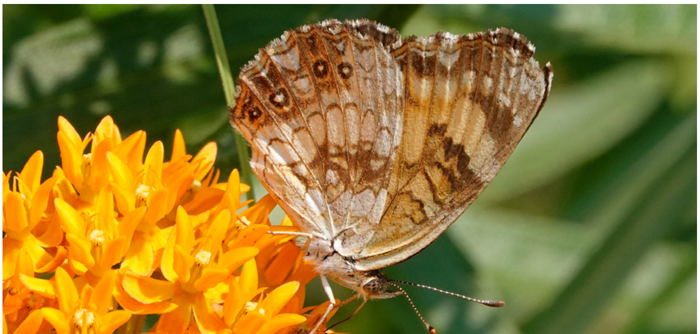
Chlosyne nycteis (silvery checkerspot) uses Rudbeckia hirta (black-eyed Susan) as a host plant.