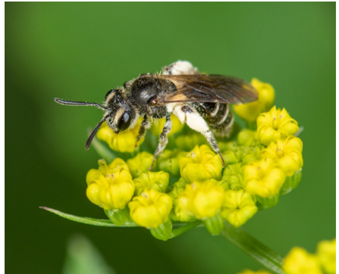
Andrena ziziae (golden-alexanders mining bee) uses Zizia (Alexanders) species as a host plant.