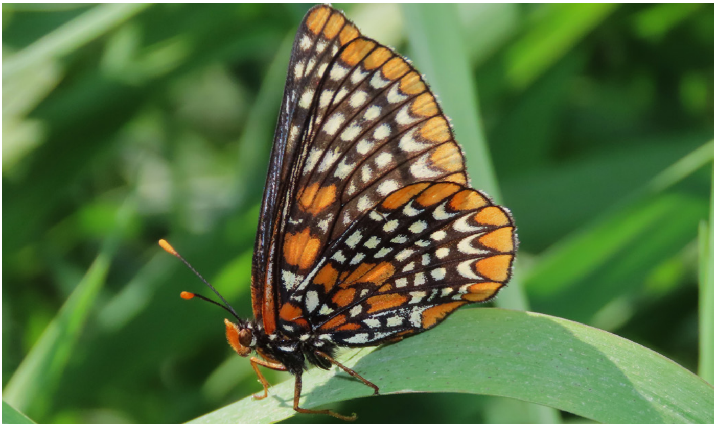
Euphydryas phaeton (Baltimore checkerspot) uses Chelone glabra (white turtlehead) as a host plant.