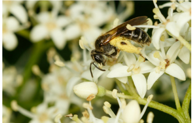
Andrena platyparia (plated miner bee) uses Cornus (dogwood) species as a host plant.