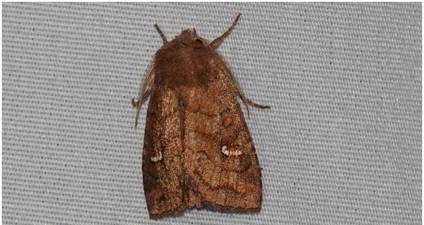
Tricholita signata (signate Quaker) uses Cirsium muticum (swamp thistle) as a host plant.