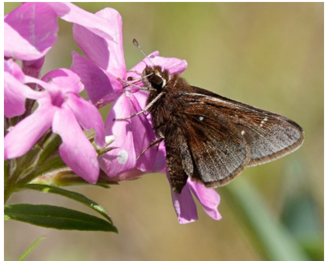
Atrytonopsis hianna (dusted skipper) uses Andropogon gerardii (big bluestem) as a host plant.

Oidaematophorus eupatorii ( Eutrochium maculatum )