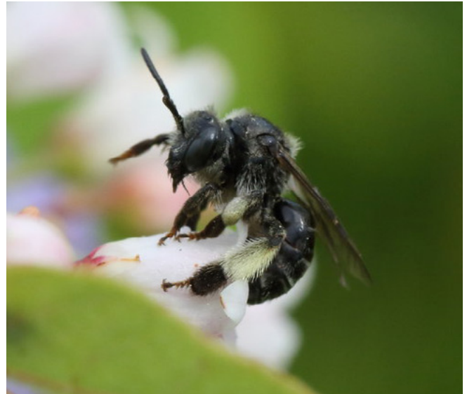
Macropis nuda uses native Lysimachia (loosestrife) species as a host plant.

Carmenta pyralidiformis ( Eupatorium perfoliatum )