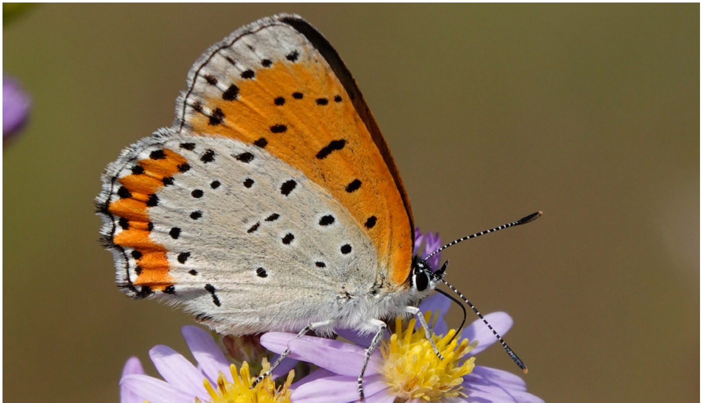
Tharsalea hyllus (bronze copper) uses Polygonum (knotweed, smartweed) species as a host plant.