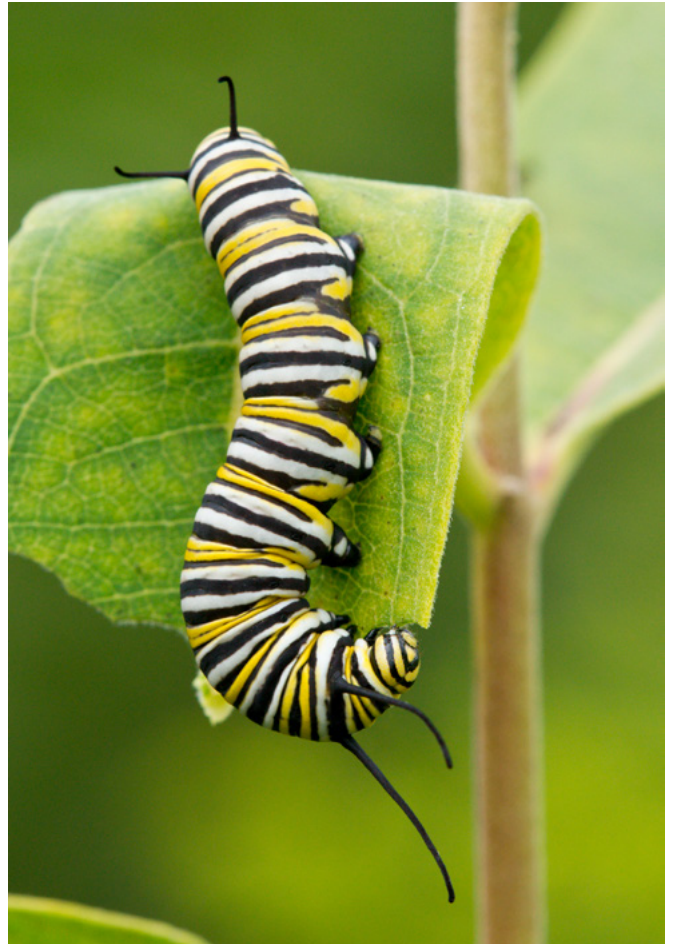
Danaus plexippus (monarch) uses Asclepias (milkweed) species as a host plant.

Macronoctua onusta ( Iris versicolor ) Limnaecia phragmitella ( Typha latifolia )