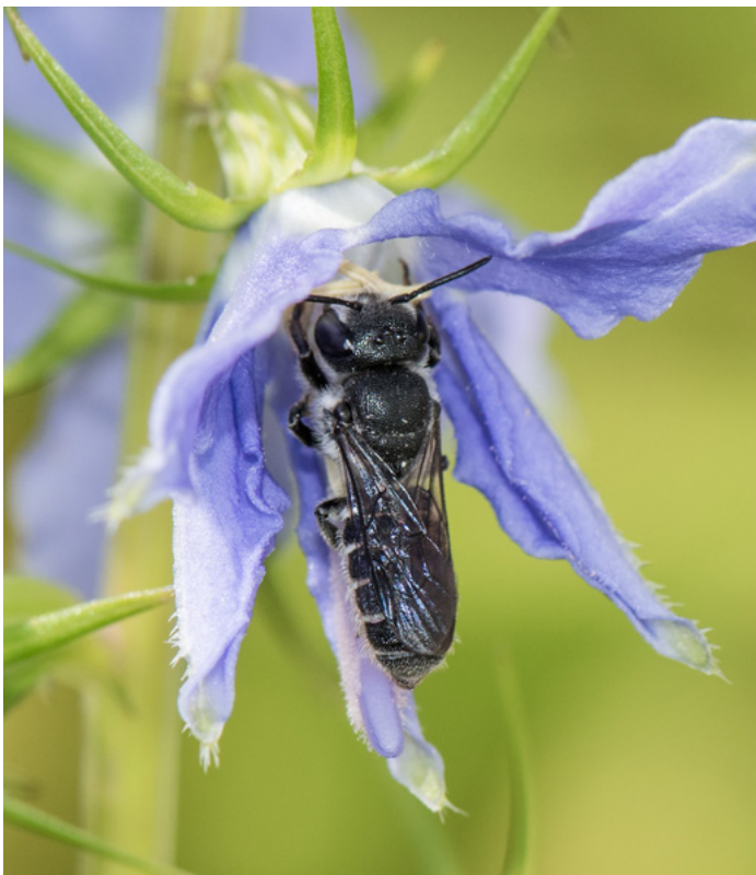
Megachile campanulae (bellflower resin bee) uses Campanula (harebell) species as a host plant.