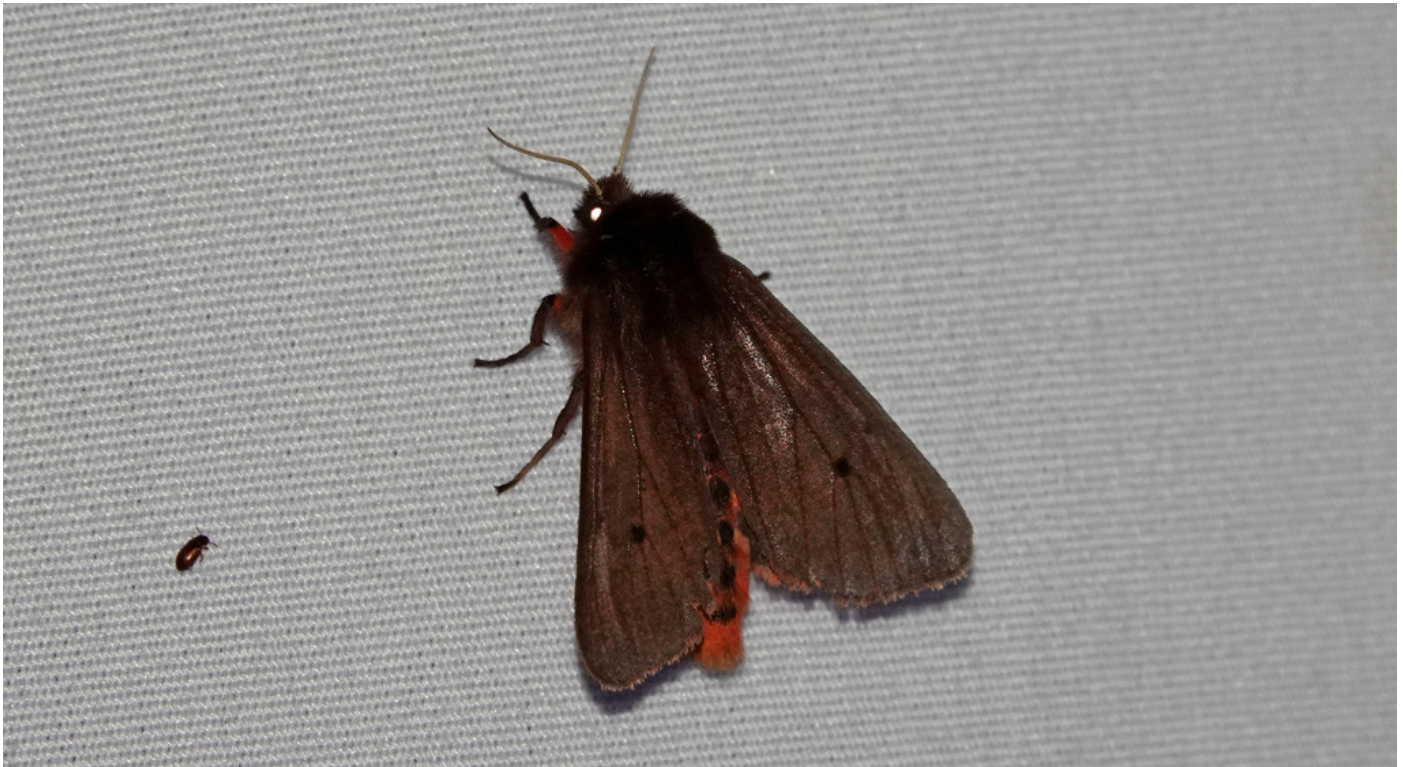
Phragmatobia fuliginosa (ruby tiger moth) uses Eutrochium maculatum (spotted joe-pyeweed) as a host plant.