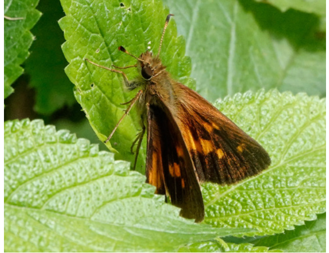
Poanes viator (broad-winged skipper) uses Carex lacustris (lake sedge) as a host plant.

Phragmatobia fuliginosa ( Eutrochium maculatum )