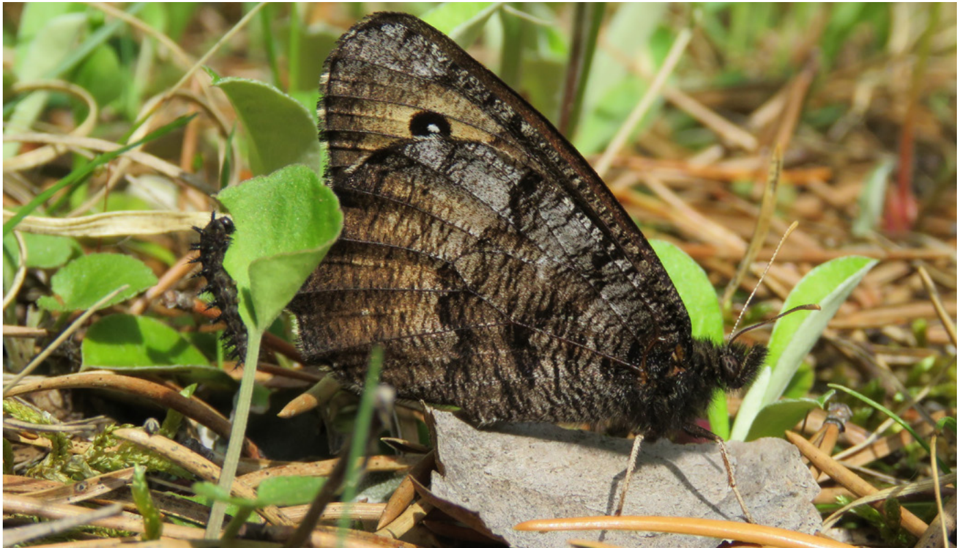
Oeneis macounii (Canada Arctic) uses Oryzopsis asperifolia (roughleaf ricegrass) as a host plant.