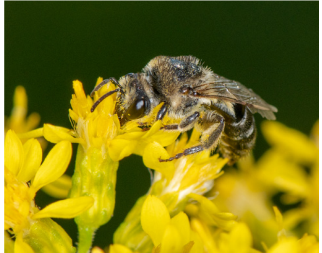
Colletes simulans (spine-shouldered cellophane bee) uses Solidago (goldenrod) species as a host plant.

Lithophane innominata ( Acer saccharum ) Dichomeris bilobella ( Solidago flexicaulis ) Christoneura fumiferana ( Abies balsamea )