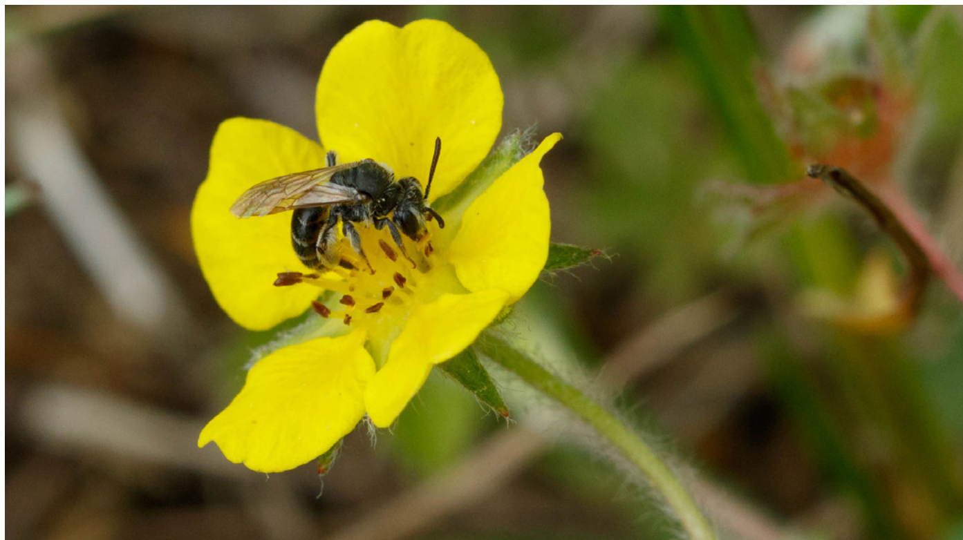
Andrena melanochroa (rose miner bee) uses species in the Rosaceae (rose) family as a host plant.