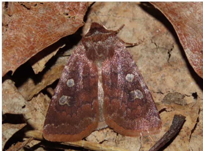
Cerastis tenebrifera (reddish speckled dart) uses Anemone quinquefolia (wood anemone) as a host plant.

Phyllonorycter apparella ( Populus tremuloides )