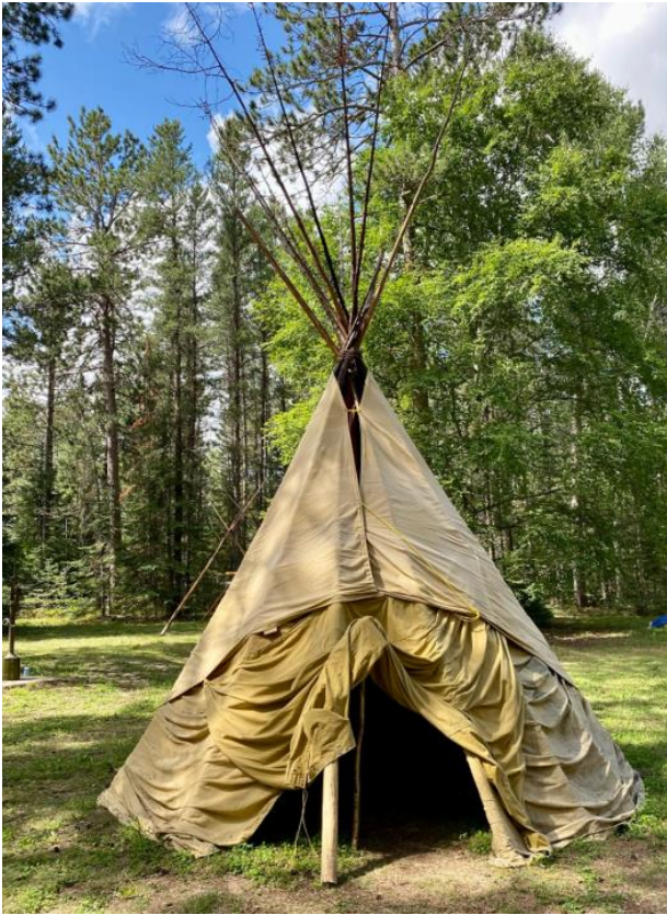
Above: one of several traditional structures erected by the Manidoo-Ogitigaan group