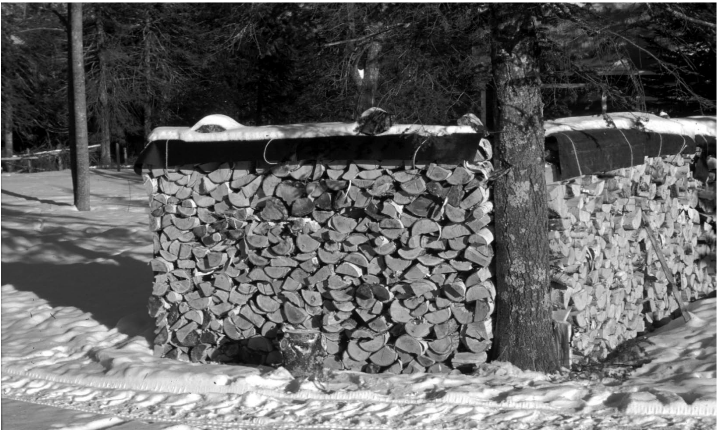
Stack firewood in a sunny, well-drained location 30 feet or more from your house. Cover your pile to keep out rain and snow.

Some tree species are naturally resistant to decay and insect attack, and can provide long-lasting fence posts. The natural resistance varies from tree to tree and is particularly dependent on the age of the tree. Younger trees have less heartwood and are less resistant.