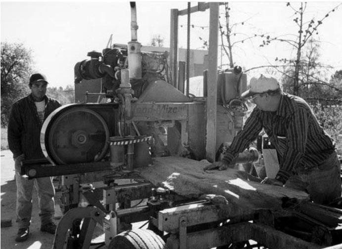
A portable mill can convert your backyard woods sawlogs into lumber for do-it-yourself projects.

Sawlogs converted to green (fresh-from-the-saw) lumber can be adequately air dried outdoors for rough construction uses such as sheds, barns, fences, and crates. Successful air-drying is dependent upon warm air temperature, low relative humidity, and good circulation of the air within the pile. The temperature and relative humidity vary with