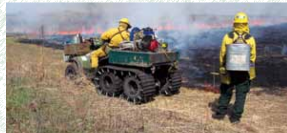
In established prairies, burn no more than 1/_3 to 1/_2 of the available habitat.

Annual weeds generally are not a problem with a well-managed mowing regime and will usually drop out by the third year.