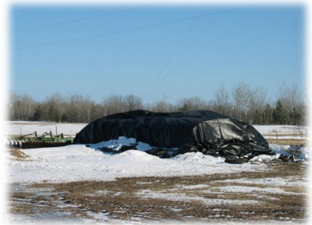
An ag bag covered with geo-textile

Ag-bags are used for the storage of silage, high moisture corn, and other livestock forage. The bags are costly at upwards of $500 each for larger bags, and cannot be reused. It is common practice for the farmer to leave the end of the bag open as the feed is used. This practice creates an open invitation to deer. Once deer have established a pattern of feeding control becomes difficult. The bags are easily punctured by random deer activity that allows new access points to the high quality feed. The bags are intended to store forage in an air-tight environment. Economic loss to the farmer results from spoiled feed. An advantage of geo-textile fabric is that is available in lengths sufficient to cover ag-bags in one continuous piece. Disadvantages are its weight and wind resistance.