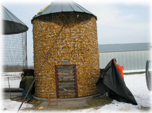
Installing geo-textile fabric