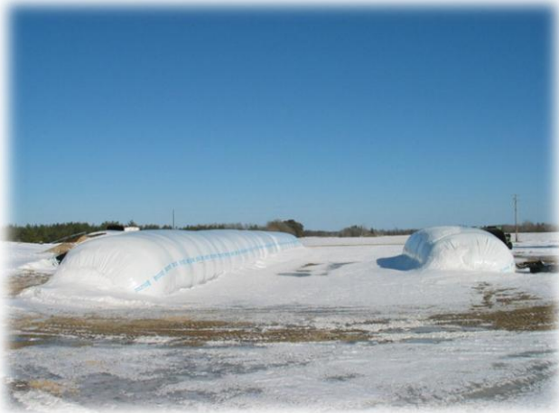
Typical use of ag bags