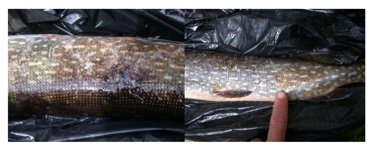
A northern pike suspected to be infected with lymphosarcoma from a Walker area lake (photo by MN DNR, 07/06/2009).