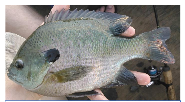
A large bluegill from one of the proposed special regulation lakes in the Glenwood Area.

Details on the regulation proposal process and public input meetings will be forthcoming. However, we welcome comments at any time.