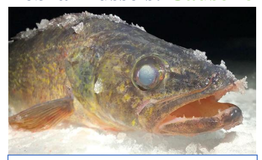
Walleye have a reflective layer in the eye, allowing them to see in low light.

Most lake users have heard of zebra mussels, a shellfish invader that made its way to the United States from the Caspian Sea region in the ballast water of Great Lakes cargo ships in 1989. Since being recorded in Duluth harbor, zebra mussels have expanded throughout Minnesota. They were first discovered in the Glenwood Management Area in Lake Le Homme Dieu in 2009, and have expanded to new lakes over the past decade. However, it can take over a decade before the full environmental and ecological effects are evident. Zebra mussels tend to have a rapid expansion after introduction, before hitting peak abundance, then declining and stabilizing. With no significant native predators, control is difficult once in a lake.