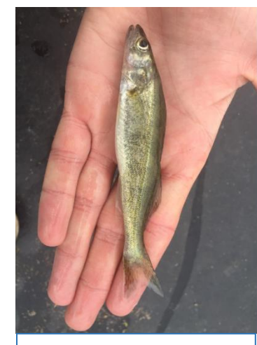
Walleye fingerling ready for stocking into area lakes.

Bottom line, most often we can produce net catches of walleye in the 2 to 5 fish/net range with fry stocking. This is considered a low to moderate abundance and is very similar to the better net catches we have found using fingerlings. It makes much more