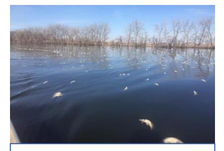
Winterkill on Lightning Lake.

Winterkill is a term used to describe a fish die-off in winter because dissolved oxygen was not sufficient for fish to survive. Shallow, productive lakes, like those found in Grant and Stevens County, are those most vulnerable to winterkill. Heavy snow can limit the sunlight reaching aquatic plants in some area lakes, reducing the amount of oxygen created by photosynthesis. Additionally, if vegetation dies from lack of sunlight, the plants start to decompose, which uses oxygen.