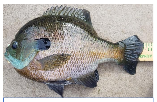
A 10.5-inch West Central Minnesota bluegill.

Large sunfish have become scarce in many Minnesota lakes. In response to angler desire for larger sunfish, local fisheries managers are identifying lakes that would be a good fit for improvements in sunfish size by reducing bag limits.