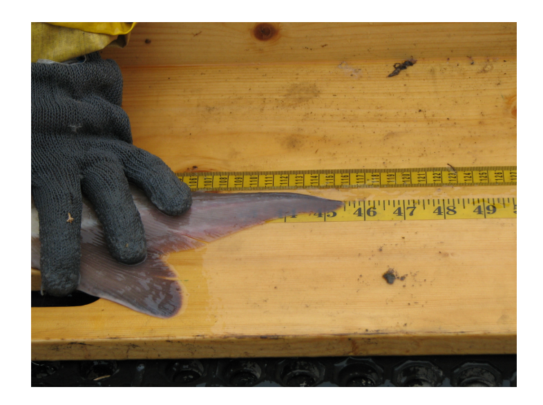
Example of a 45.5 inch long lake sturgeon