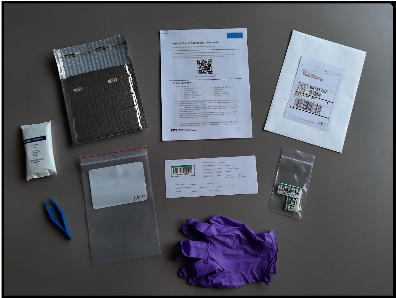
Figure 2. Contents for the hunter mail-in kits as part of our expanded statewide effort to encourage hunters to participate in CWD testing.