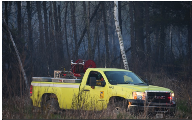
Engine on initial attack, Lake Hattie fire, Beltrami County

Efforts to reduce the number of arson fires in Minnesota continued in FY16, including the increased presence of firefighting resources in problem areas and improved detection of fire starts via aerial detection and the ForestWatch system. The number of arson fires remain below the 20 year average.