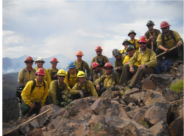
Interagency Fire Crew

In July through October of 2015, one of the most intense fire seasons on record to the western United States continued. Nationally, there was a critical shortage of resources to fight the fires. While the national fire activity in the summer of 2016 was considerably less than that of 2015, the DNR was still very active sending firefighting resources out of state. The DNR and other Minnesota Incident Command System (MNICS) agencies responded by mobilizing crews, aircraft, and overhead personnel to other portions of the country. These requests are supported through mutual aid agreements, with costs reimbursed to the state.