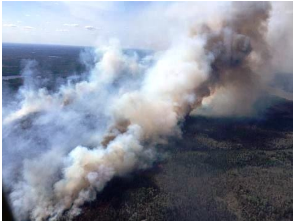
Foss Lake Fire, St. Louis County