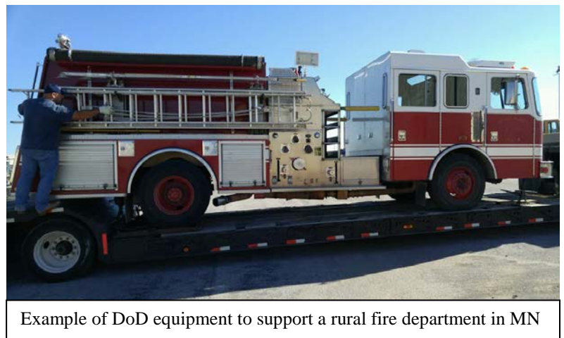
Example of DoD equipment to support a rural fire department in MN

Division of Forestry. Since January 2016, over 5,000 pieces of equipment and tools, including 4 fire trucks with a combined value of over 4.5 million dollars, were acquired to support Fire Departments and EMS services in the state. In FY 2016, the $220,000 allocated to this program benefited over 200 fire departments and emergency response teams.