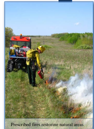
Prescribed fires restore natural areas