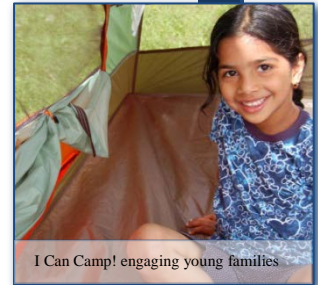
I Can Camp! engaging young families