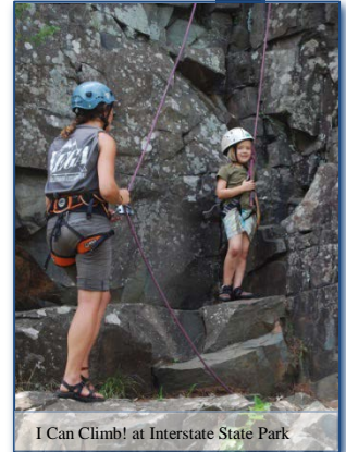
I Can Climb! at Interstate State Park

FY11 Funds Expended/Encumbered as of 12/31/2011: $3,203,616