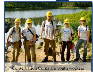
Conservation Corps are youth workers