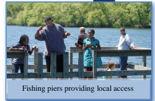
Fishing piers providing local access