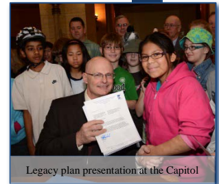
Legacy plan presentation at the Capitol