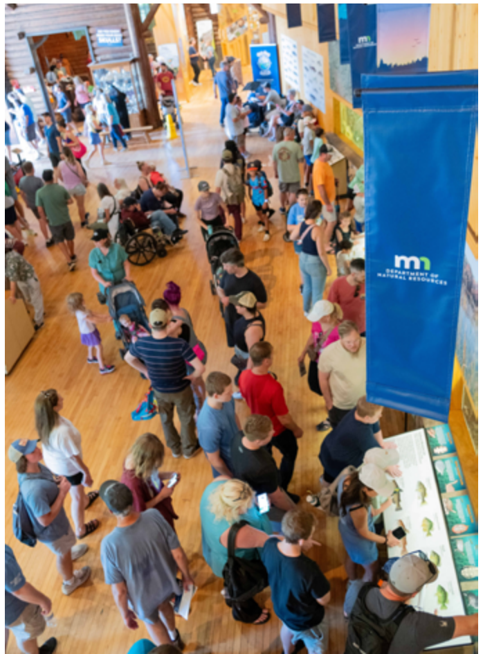
Fair goes inside the Minnesota Department of Natural Resources building