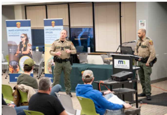
Conservation Officers presenting at a recruitment event