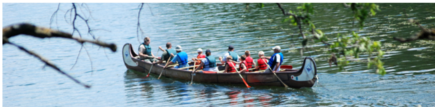
Canoe ride at Glacial Lake State Park

This document is intended to be an overview of select DNR facts and figures. Numbers are rounded and based on the best available information.