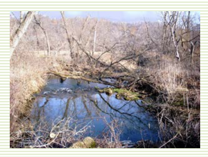
A before (above) and after(below) photo of Hay Creek is taken before and after seeding, mulching and placement of erosion control blanket in 2010.