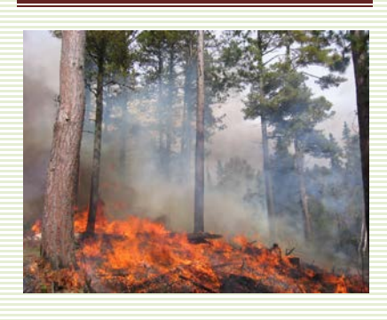
A prescribed burn near Cloquet. This 76 year stand of old white pine was burned in late September 2010 after being thinned in the fall of 2009. The objectives were to set back brush competition as well as expose mineral soil for pine regeneration. The desired future stand condition is to decrease the balsam fir, slightly increase the paper birch, white spruce, and black spruce, while maintaining the white pine and Norway pine component. These stands will be surveyed for regeneration success (a form of monitoring) starting in 2012.