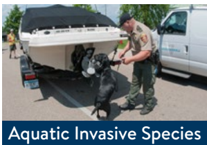
Aquatic Invasive Species