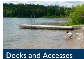
Docks and Accesses