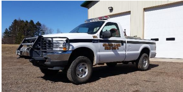
State surplus engine - Grand Lake Fire Department

The state-funded Rural Fire Program secured ten one-ton trucks from the State fleet program at a reduced price. This approach eliminated auction and selling costs for Minnesota fire departments. Although these trucks have met the criteria for replacement by state agency fleet managers, they still have service life and can be used as grass trucks to extinguish small fires. The demand by rural fire departments for these units exceeds their availability.