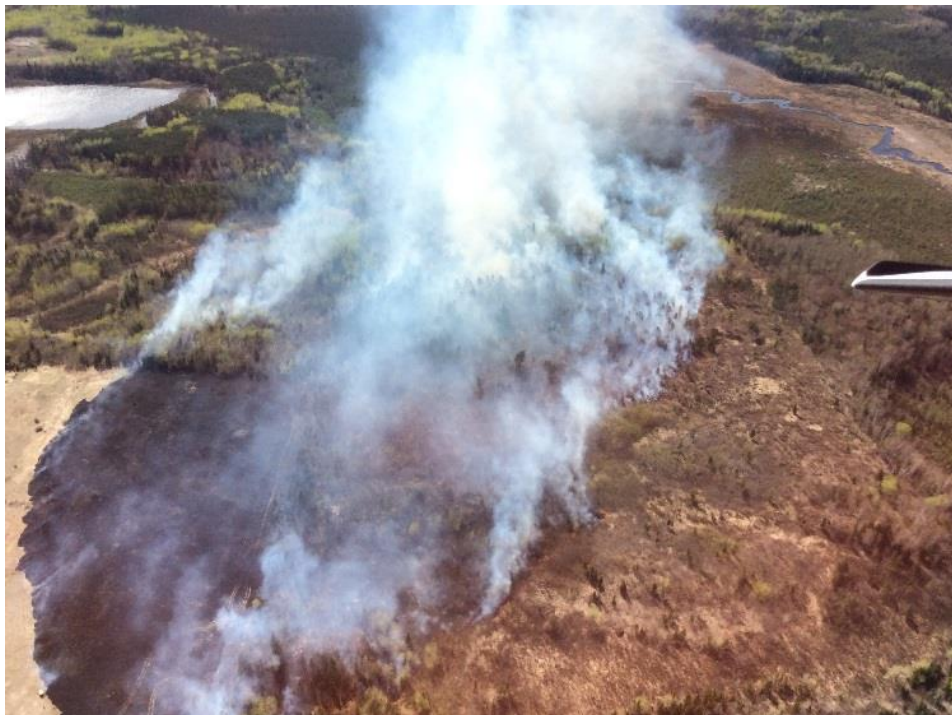
Little Lake Fire – St. Louis County