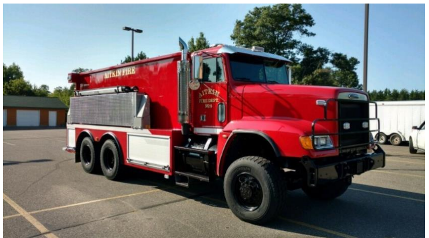
Converted federal surplus equipment - Aitkin Fire Department

In FY2019, the Firefighter Federal Property program (FFP) obtained $12 million in equipment and supplies, which it distributed to 375 Minnesota communities and three state agencies. Highlighted items include medical supplies and equipment such as tourniquets, bandages, defibrillators, and portable generators. Rolling stock included items such as a Freightliner chassis and ATVs. Many rural fire departments in Minnesota could not afford this equipment if not for the FFP program.