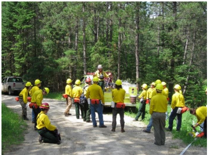
Students receive instruction on the use, deployment, and tactics of engines on wildland fires

The 2019 Wildfire Academy held June 3-7, at Itasca Community College in Grand Rapids, offered 29 classes to 862 students. Instructors and staff from DNR, MNICS partners, and GLFFC worked together to provide the training. Participants included staff from Minnesota DNR; Wisconsin DNR; Michigan DNR; Iowa DNR; National Park Service-Wisconsin; USFS – Minnesota (both national forests), Colorado, Ohio, West Virginia, North Dakota, South Dakota, Nebraska, Wisconsin, Michigan, New York, Missouri; U.S. Fish & Wildlife – South Dakota and Nebraska; and the BIA. Students also came from the