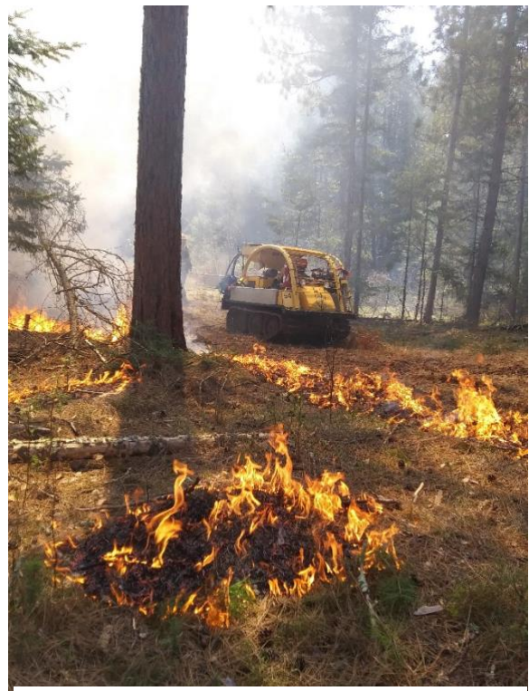
J5 Operating in Remote Area

Preparedness (prevention and presuppression) and suppression activities work together to reduce wildfire damages. Presuppression encompasses actions taken before a fire starts in order to ensure more effective suppression. These activities include overall planning, recruitment, and training of personnel; procurement of firefighting equipment and contracts; and maintenance of equipment and supplies. Suppression costs include activities that directly support and enable the DNR to suppress wildfires, including the prepositioning of resources. As fire danger and fire occurrence increase, the resources that must be positioned for immediate response also increase. Presuppression costs were approximately 47 percent, or $10,878,448, of the Direct