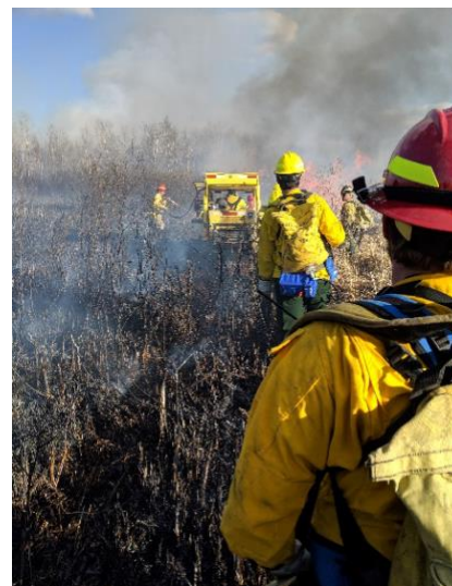
First-year firefighters mop up a wildfire near Sandstone.

In the last half of 2018, the DNR and other MNICS agencies actively mobilized crews, aircraft, and overhead personnel to fill resource requests by western states and Canada for fire suppression efforts. However, the first half of 2019 saw lower than average national fire activity with a dramatic decrease in resource requests. Consequently, the DNR mobilized significantly fewer individuals than in past years.