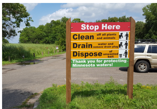
Eye-catching sign design prompts boaters to take AIS prevention actions.