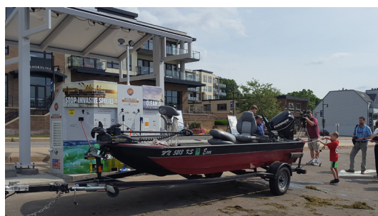
Initiative Foundation pilot project "Deploying Watercraft Cleaning Stations to Empower Clean Drain Dry Actions." Led by Wildlife Forever and CD3 General Benefit Corp., five waterless "Clean, Drain, Dispose, Dry" (CD3) stations provide tools for boaters to use at water accesses to help prevent the spread of AIS.