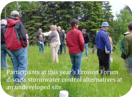
Participants at this year's Erosion Forum discuss stormwater control alternatives at an undeveloped site.

What they delivered was a full day of speakers and tours. Three local experts shared their perspectives on