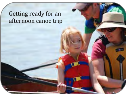
Getting ready for an afternoon canoe trip

For those in the later group, the St. Louis River Alliance is offering FREE, full-day canoeing and hiking trips along the St. Louis River on July 24, and August 24 starting at 10:00 AM.