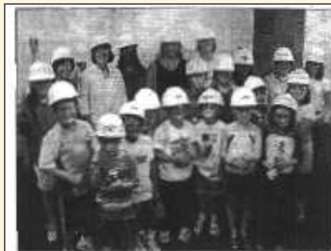
A large group of young actors visited North Shore Mining in Silver Bay to learn about the impact of industry on Lake Superior. The actors were learning about the environment in preparation for the play, The Lorax .

Lake Superior Coastal Program 1568 Highway 2 Two Harbors, MN 55616 Phone: 218.834.6612 www.dnr.state.mn.us/waters/lakesuperior