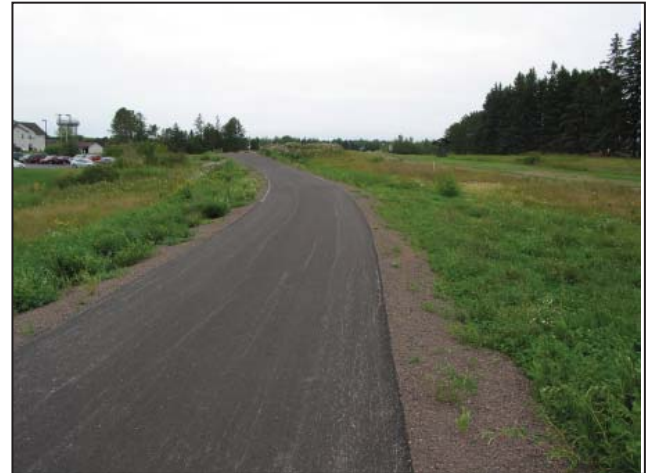
A view of the Trail along Highway 2, in Two Harbors, MN.