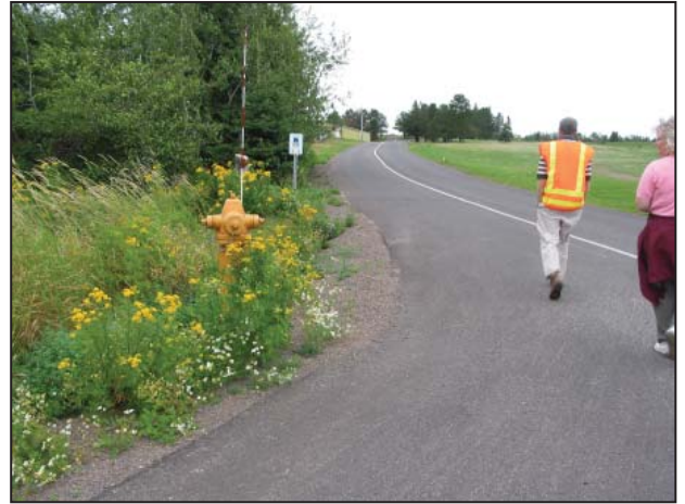
Inspecting the Trail, along the golf course in Two Harbors, MN.

The trail has quickly become a popular attraction, one that promotes a healthy lifestyle for the community. Every day, the trail sees heavy use by walkers and bicyclists seeking a safe and pleasant route through their neighborhood.